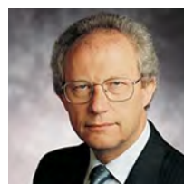
Henry McLeish Former First Minister of Scotland