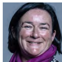
Alison Mary Suttie Baroness Suttie is a British Liberal Democrat politician.