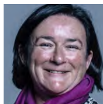
Alison Mary Suttie Baroness Suttie is a British Liberal Democrat politician.