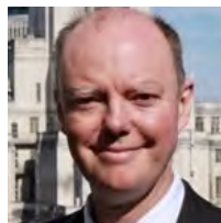
Sir Christopher John MacRae Whitty Chief Medical Office for England