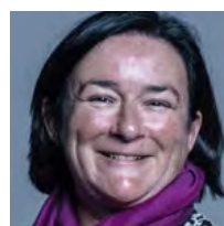
Alison Mary Suttie Baroness Suttie is a British Liberal Democrat politician.