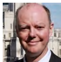
Sir Christopher John MacRae Whitty Chief Medical Office for England