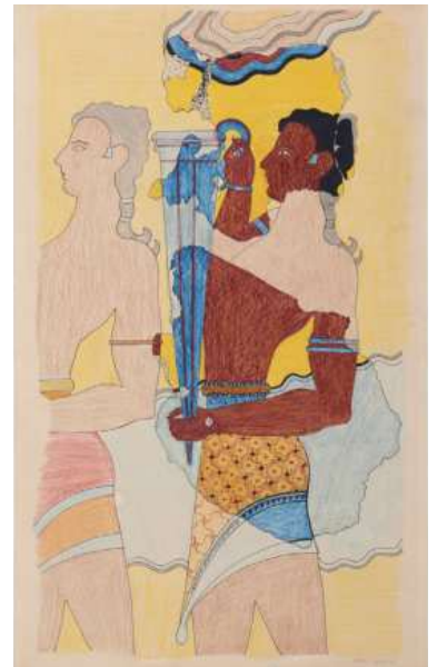
Cup-bearer fresco restoration drawing from Knossos.

Each of these circles has a tailored package of entitlements. Unrestricted charitable donations are hugely valuable and ensure that the BSA can prioritise urgent projects which have the greatest need. By making an unrestricted gift you can be sure that your donation will have an immediate impact.